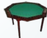
Rosewood Poker Tables