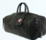
WPT® Leather Bags